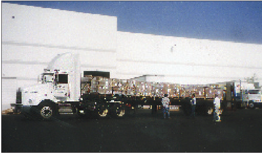
YOU LOAD 23 TONS: Big rig with 23 tons of brochures for Knights.