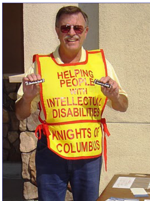
Local shoppers answered the call last month to help make the ID Drive another big success.