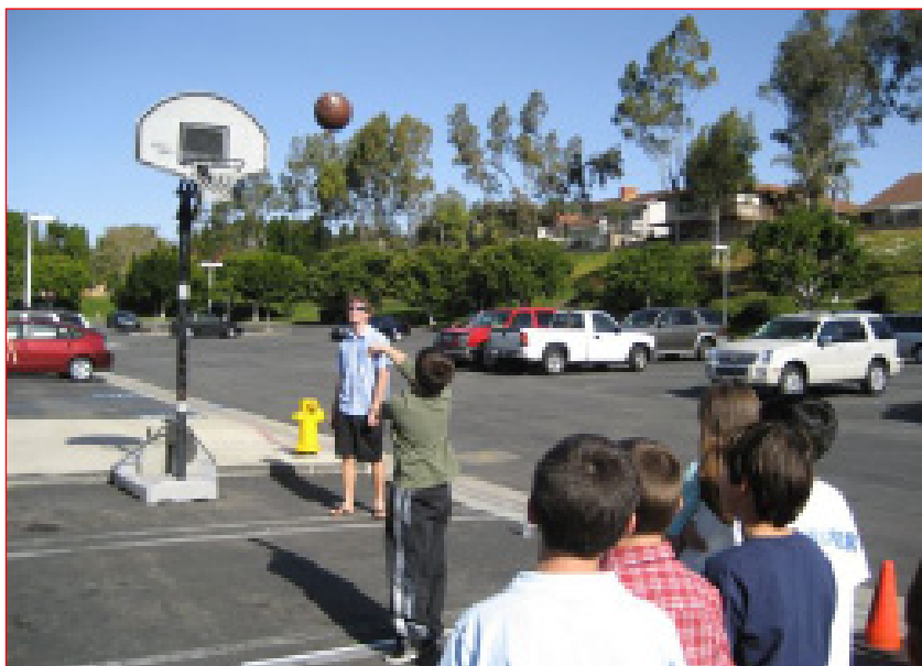
HOOPING IT UP: Youngsters line up their free-throw shots at last year's contest.

Merry Christmas from my family to you and yours.